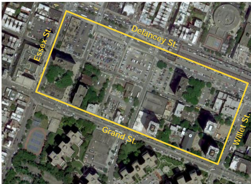
If you lived in the outlined area between 1965 and 1973, you may be eligible for the former site tenant (FST) preference.

Individuals qualify as FSTs if they lived in the Seward Park Extension Urban Renewal Area (SPEURA), between the years of 1965-1973. SPEURA is bounded by Delancey Street to the north, Grand Street to the south, Essex Street to the west and Willet Street to the east. Please see the map of SPEURA and the specific range of addresses in SPEURA below.